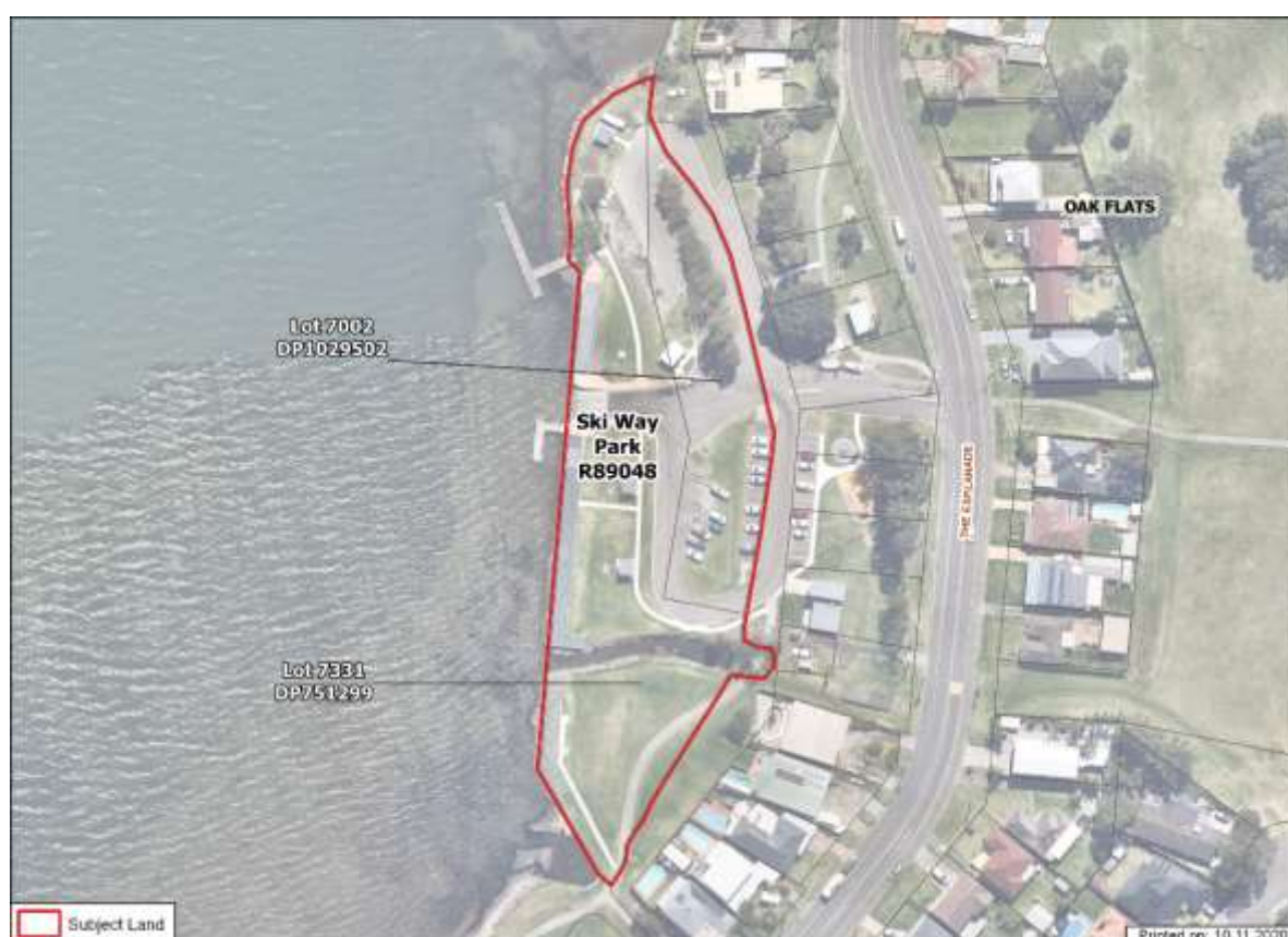
Figure 1 – Land to which this Plan applies.

This Crown reserve is part of a larger reserve of Council Community land known as Ski Way Park, however this Plan only covers Crown reserve 89048. The adjoining Council land for Ski Way Park is managed under a Community Land Plan of Management, prepared in accordance with the LG Act; please contact Shellharbour City Council for more information. See Figure 1 below for land to which this Plan applies.