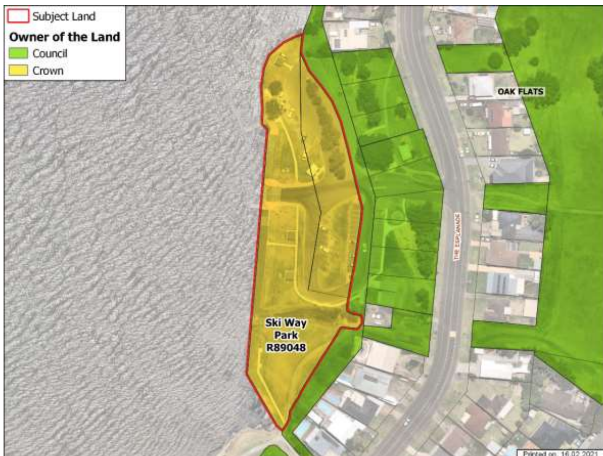
Figure 2 – Owners of the land.

See Figure 2 below showing owners of the land.