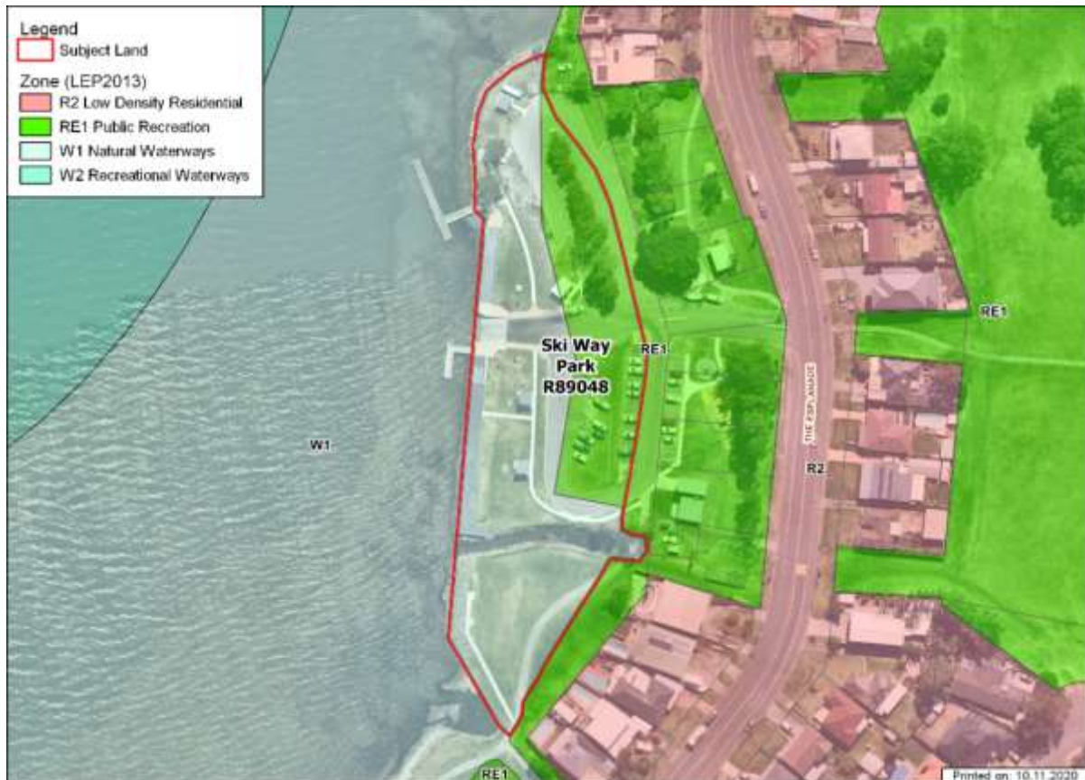
Figure 4 – Land Zones.

Ski Way Park is zoned RE1 - Public Recreation and W1 - Natural Waterway under the Shellharbour Local Environmental Plan 2013 (LEP). The reserve adjoins other lands zoned RE1 – Public Recreation and R2 – Low Density Residential. Land zones are shown in Figure 4 below.